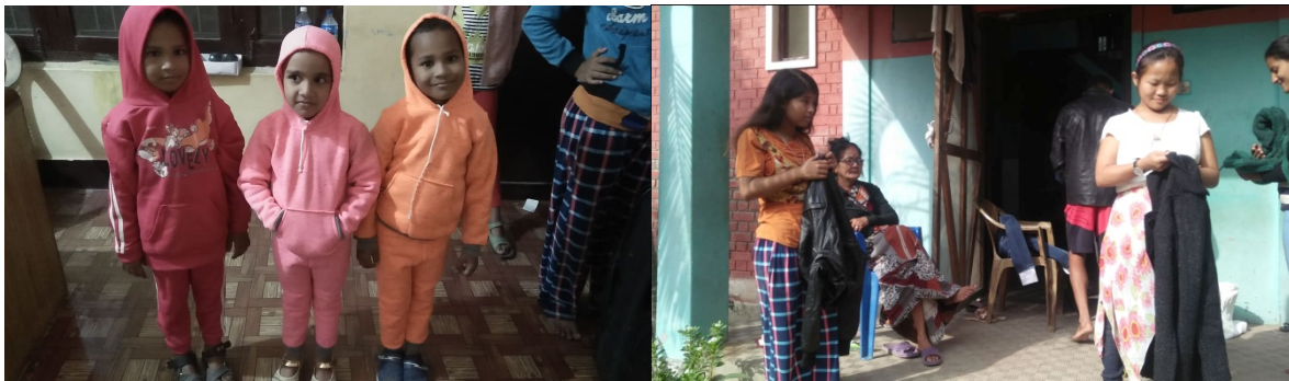
Pics: Children in Duhabi home