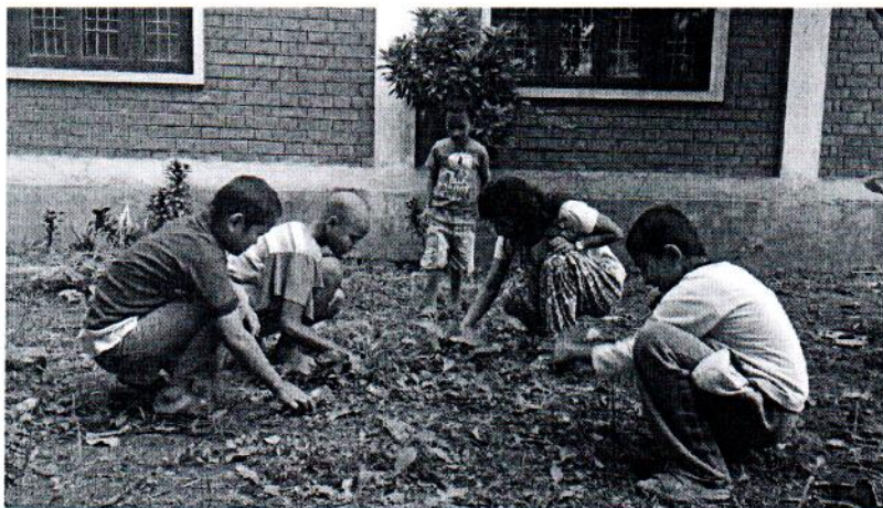
Pic: Children at Duhabi home weed out the grass of the backyard.