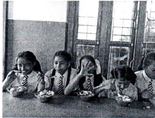
Pics: School children enjoying their school meal.

As the children presence in the school varies daily. So does the variation in food consumption. Here, in this case, the school management takes note of every student present in the school. They estimate the tentative amount of cost per day for the meal programs. SHC manager cross check the notes and register and verifies and take note of it.