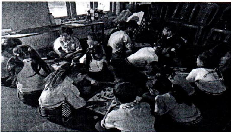
Pic. Children in leisure class playing ludo.

Need: Hang white board as at present situation white board are lay at the bottom. And also need of bigger white boards.