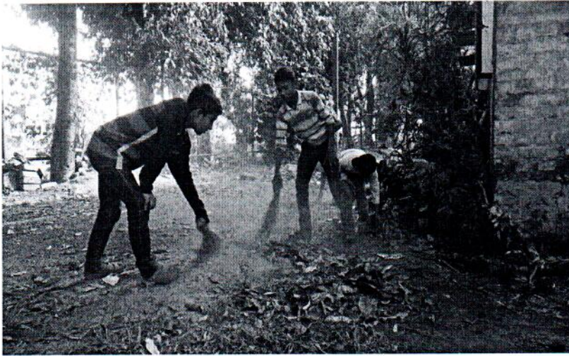
Pic: Children at Duhabi in active participation in cleaning the terrain