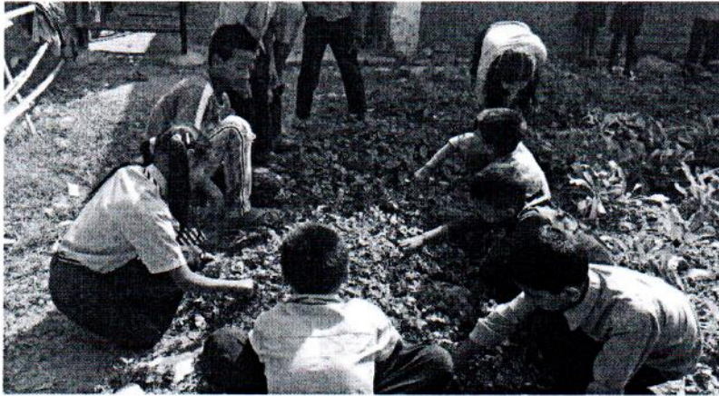
Pic: Children at vegetable garden of the school

Shift of the SHC office to the school: The shift of the SHC office starts from 10 AM to the 4 PM in the day time. It operates as usual time like of the school closes on the public holidays.