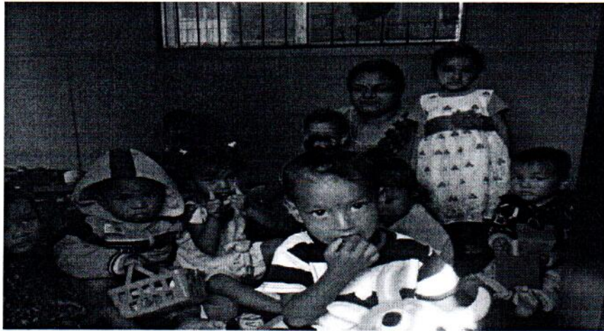
Pic. Children in day care facilities with the day care teacher

Needs: 1. More playing materials to accommodate all the children hassle free. 2. More educational resources to the children 3. Assistant day carer as it is terribly hard to handle when all the children are present at a time. Stationaries 7. Toilets for toddlers as they can't use adult toilets which is not clean for them as well.