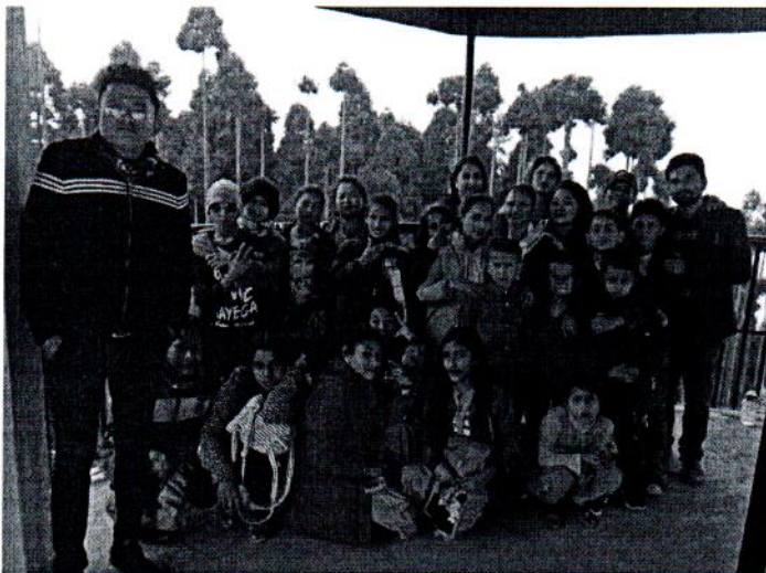
Pic: Grade 6 and 5 children enjoying the picnics with teacher( in November)

Shift of the SHC office to the school: The shift of the SHC office starts from 10 AM to the 4 PM in the day time. It operates as usual time like of the school closes on the public holidays.