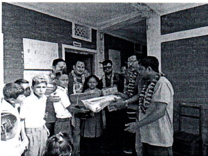
Pic: Local donation to the Dipendra school