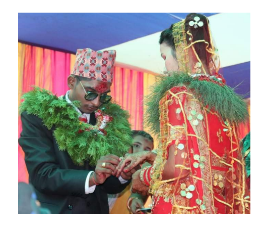
Bride and groom exchanging ring